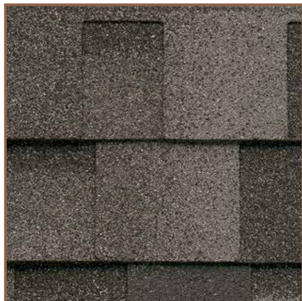
Colour featured: Biscayne

Choose from seven fresh, bold, high-definition colour blends. CRC's Colour Blend Technology offers the perfect match for your home's architecture and your personal sense of style from rustic to urban, traditional to modern. Co-ordinated hip and ridge cap shingles are the ultimate accessory to create a spectacular new roofscape for your home.